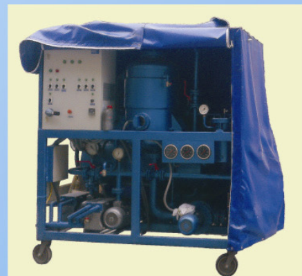
S-3000 / 6000

Belgrade, Blagoja Marjanovića 8 Tel: +381 11 2270 995 e-mail: kondics@eunet.rs e-mail: kondicdoo@gmail.com www.kondicdoo.com